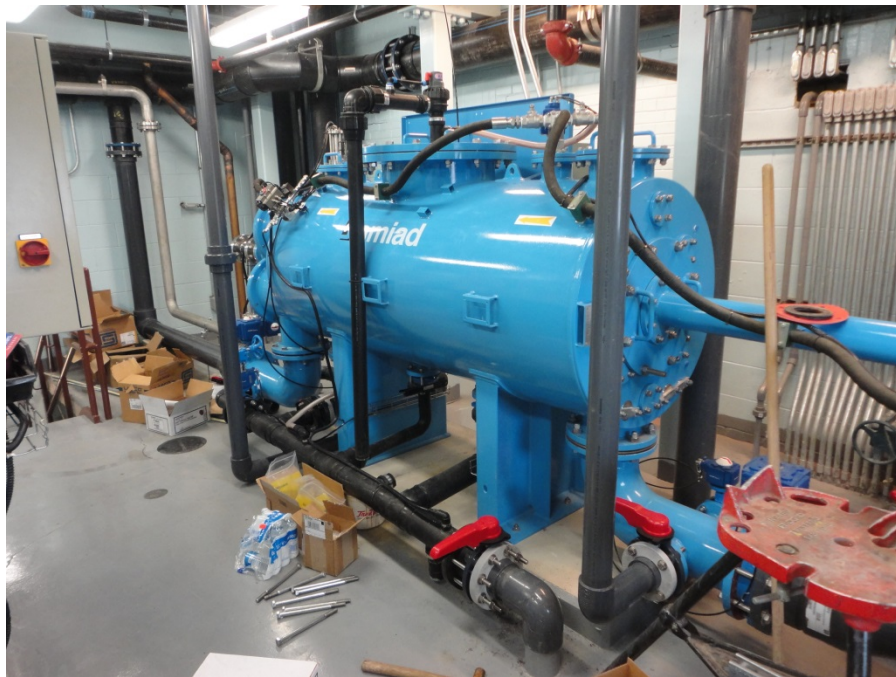
Clean-In-Place Piping for the Amiad Iron Removal Units