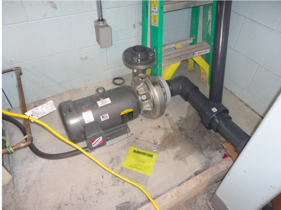
Clean-In-Place Pump for the Amiad Iron Removal Units