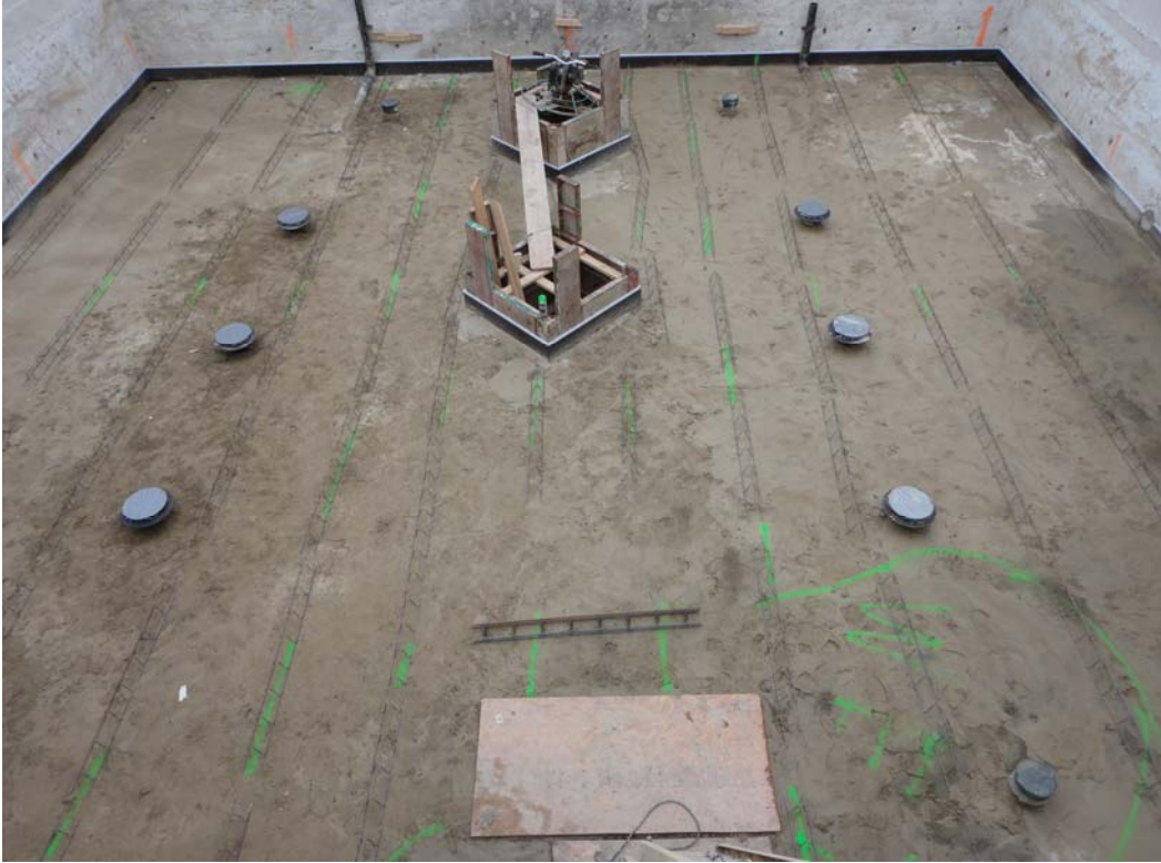
Membrane Room Progress