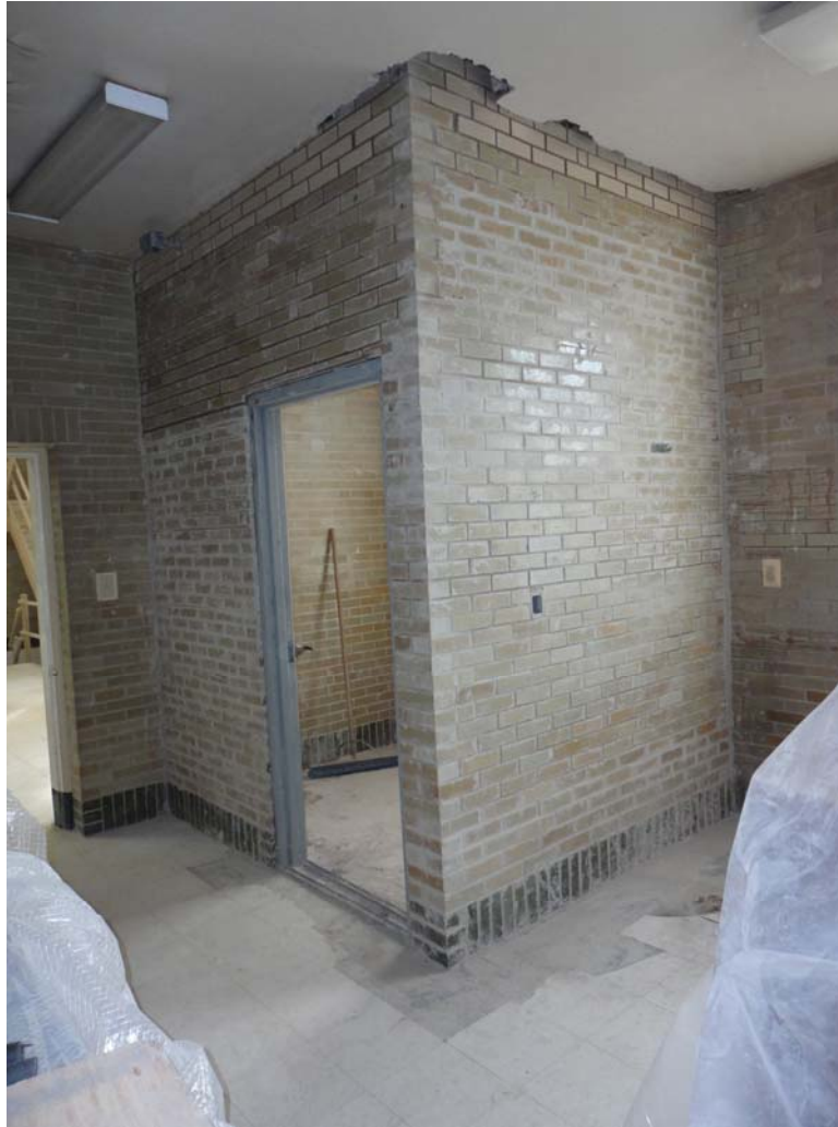
1 st Floor Bathroom Walls