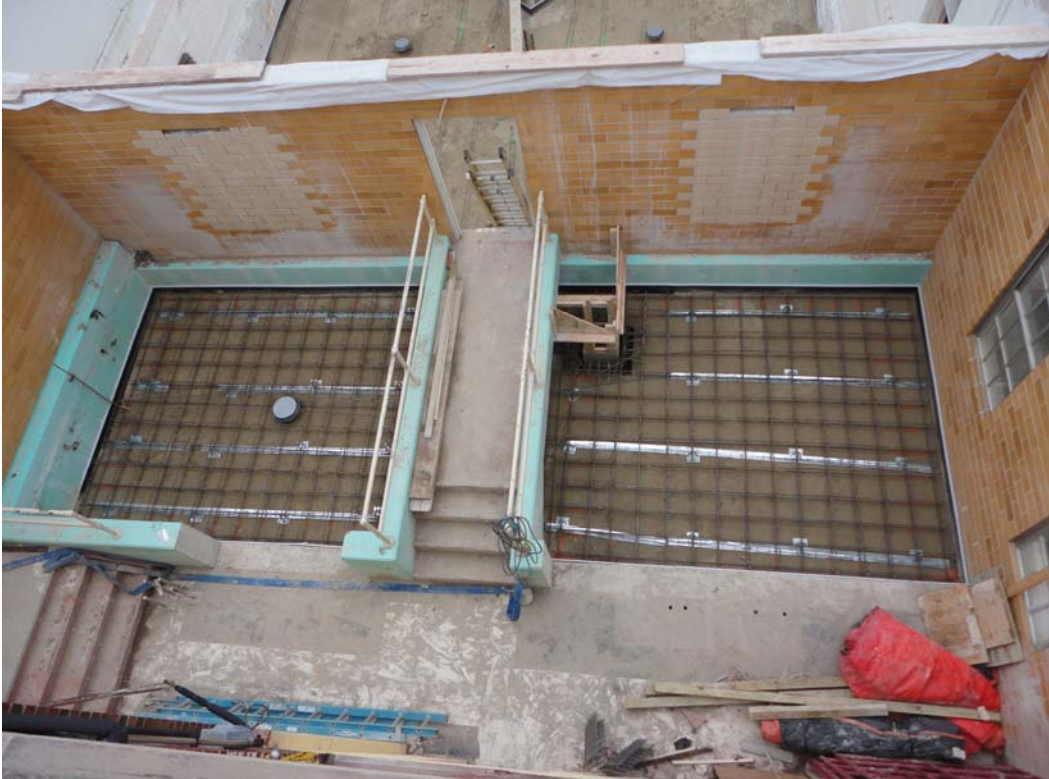
Instrumentation & CIP Rooms Progress