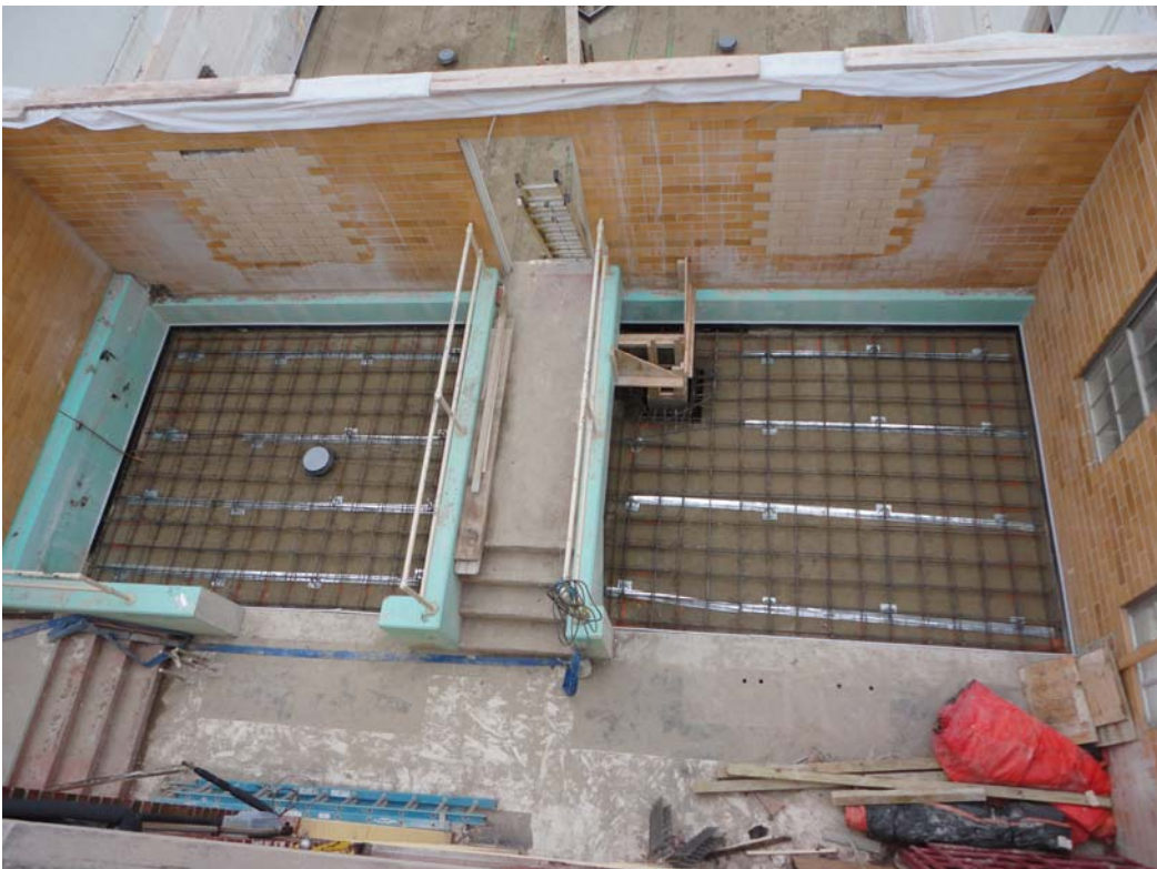
Instrumentation & CIP Rooms Progress