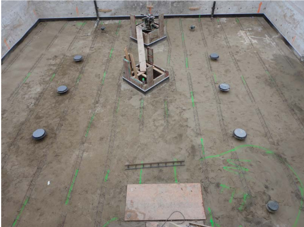
Membrane Room Progress